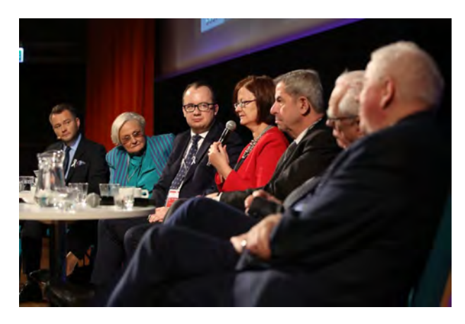
Current and former Polish Ombudsmen

agreed on a joint declaration reconfirming their commitment and the high importance they attach to the Eastern Partnership. The EaP was launched in 2009 to promote political association and economic integration between the EU and the six Eastern European partner countries: Armenia, Azerbaijan, Belarus, Georgia, Moldova and Ukraine. The summit is organized once a year with the participation of leaders from all EU and EaP Countries. More information about the summit is available here.