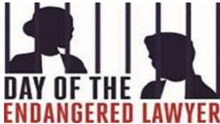
Day of the Endangered Lawyer

On the occasion of the 30th anniversary of the UN Basic Principles on the role of lawyers and in view of the above, the CCBE and all the undersigning organisations, therefore call for a more effective application of the guarantees provided by the UN Basic Principles on the role of lawyers and reiterates its strong support to the work carried out by the Council of Europe on a future European Convention on the profession of lawyer, considering that such a specific binding instrument is needed in order to preserve the independence, integrity of the administration of justice and the rule of law.