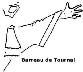
Belgium – Barreau de Tournai