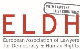
ELDH European Association of Lawyers for Democracy and World Human Rights