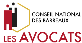
France – Conseil national des barreaux