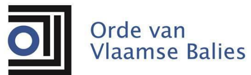
Belgium – Orde van Vlaamse Balies