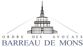
Belgium – Barreau de Mons